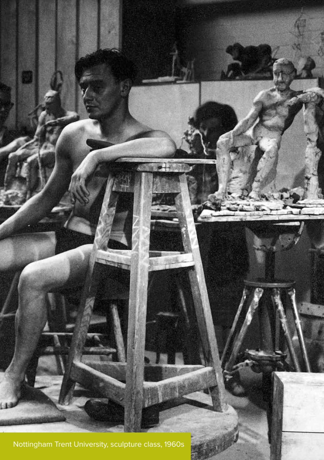
Nottingham Trent University, sculpture class, 1960s